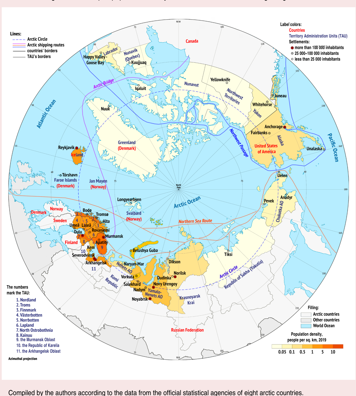
Figure 1. The map of population density in the arctic territories at the beginning of 2019

In the World Arctic, which occupies the eleventh part of the Earth's land, the population equals 5 million 438.5 thousand people, or 0.07% of the world's population. Such "scissors" between the indicators has made the Arctic the underpopulated territory -0.41