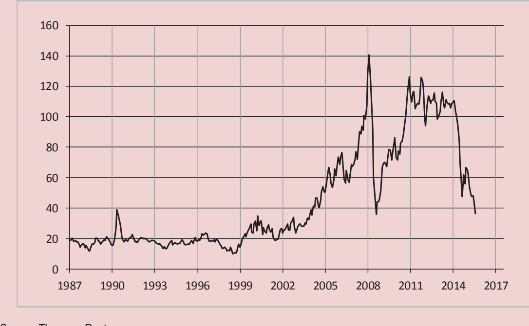
Figure 3. Prices for Brent crude for the past 28 years