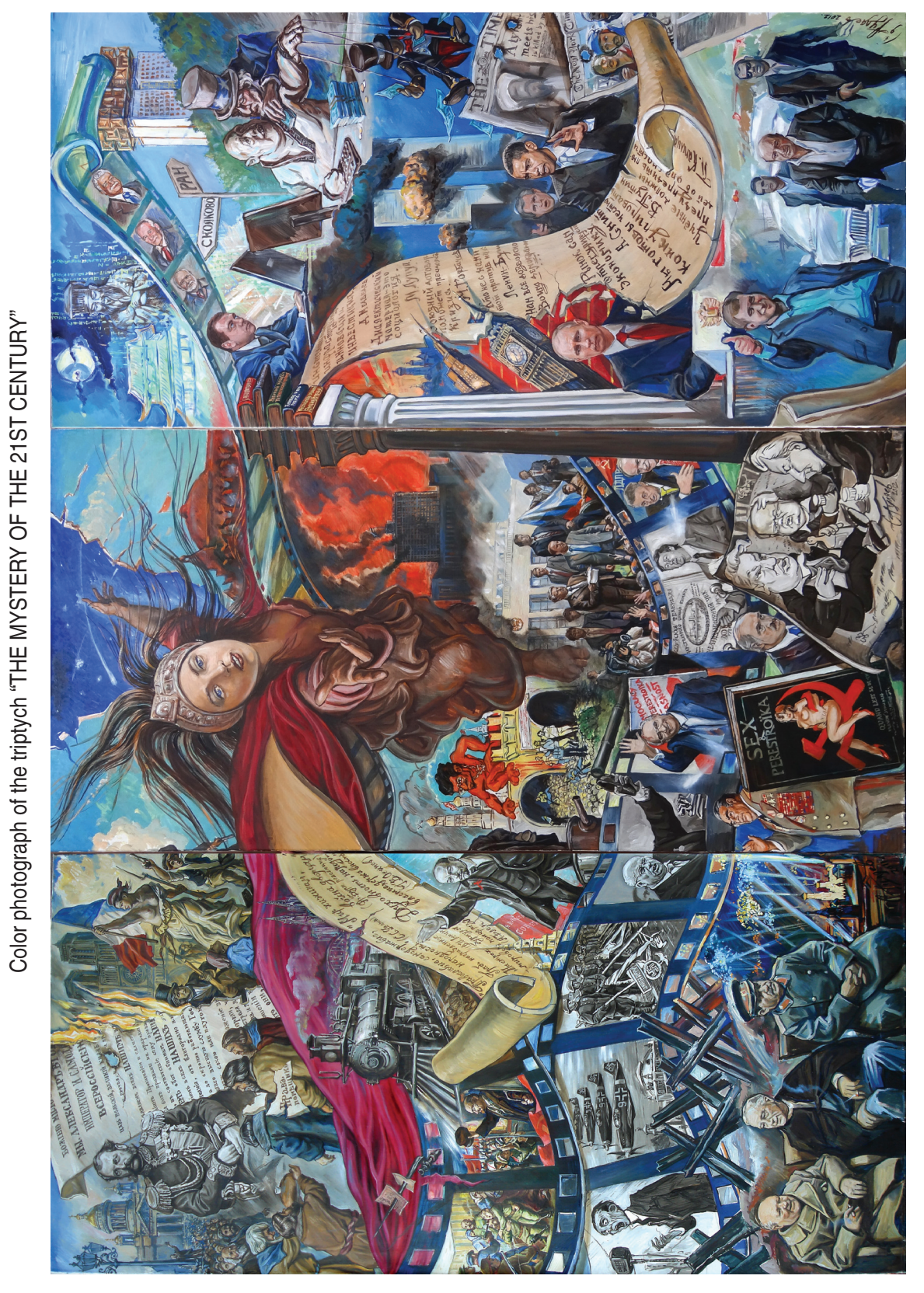
Gulyaev S. "The Mystery of the 21st Century" oil on canvas, 2013, ISPR RAS