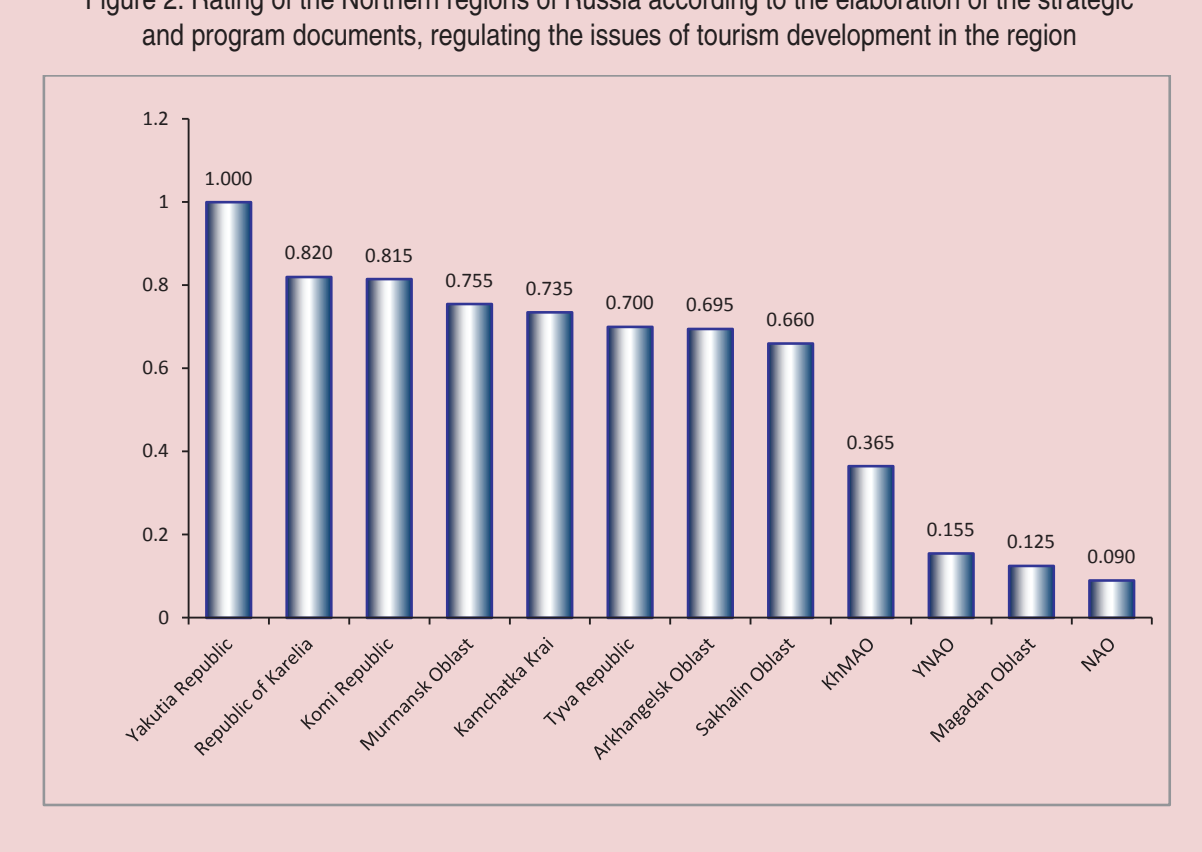
Figure 2. Rating of the Northern regions of Russia according to the elaboration of the strategic

1. Due to the administrative reform and the introduction of management procedures in compliance with the results it is required to produce state programs for tourism development at the regional level. Today it is state programs that become the key mechanism of policy implementation in a particular area, gradually putting aside other types of programs (regional, federal, etc.).