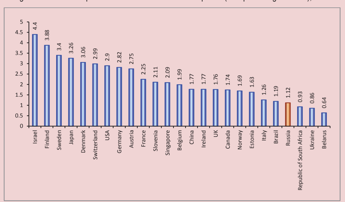
Figure 2. Domestic expenditures on research and development (as a percentage of GDP), 2011*