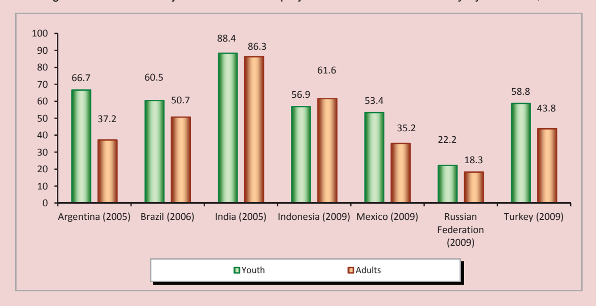
Figure 2. The share of youth and adult employees in the informal economy by countries, %