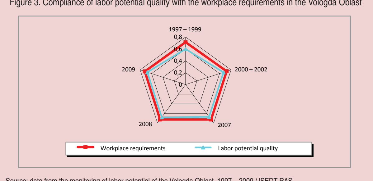
Figure 3. Compliance of labor potential quality with the workplace requirements in the Vologda Oblast