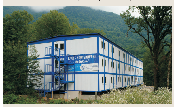
Figure 3. The prefabricated demountable threestorey building structure composed of blockcontainers (the city of Sochi)