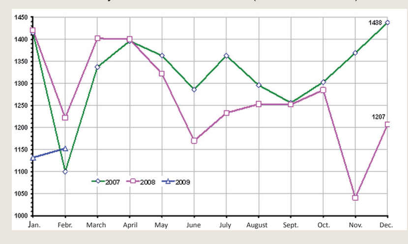
Figure 3. Goods turnover of the port of Murmansk (in thousands tons)